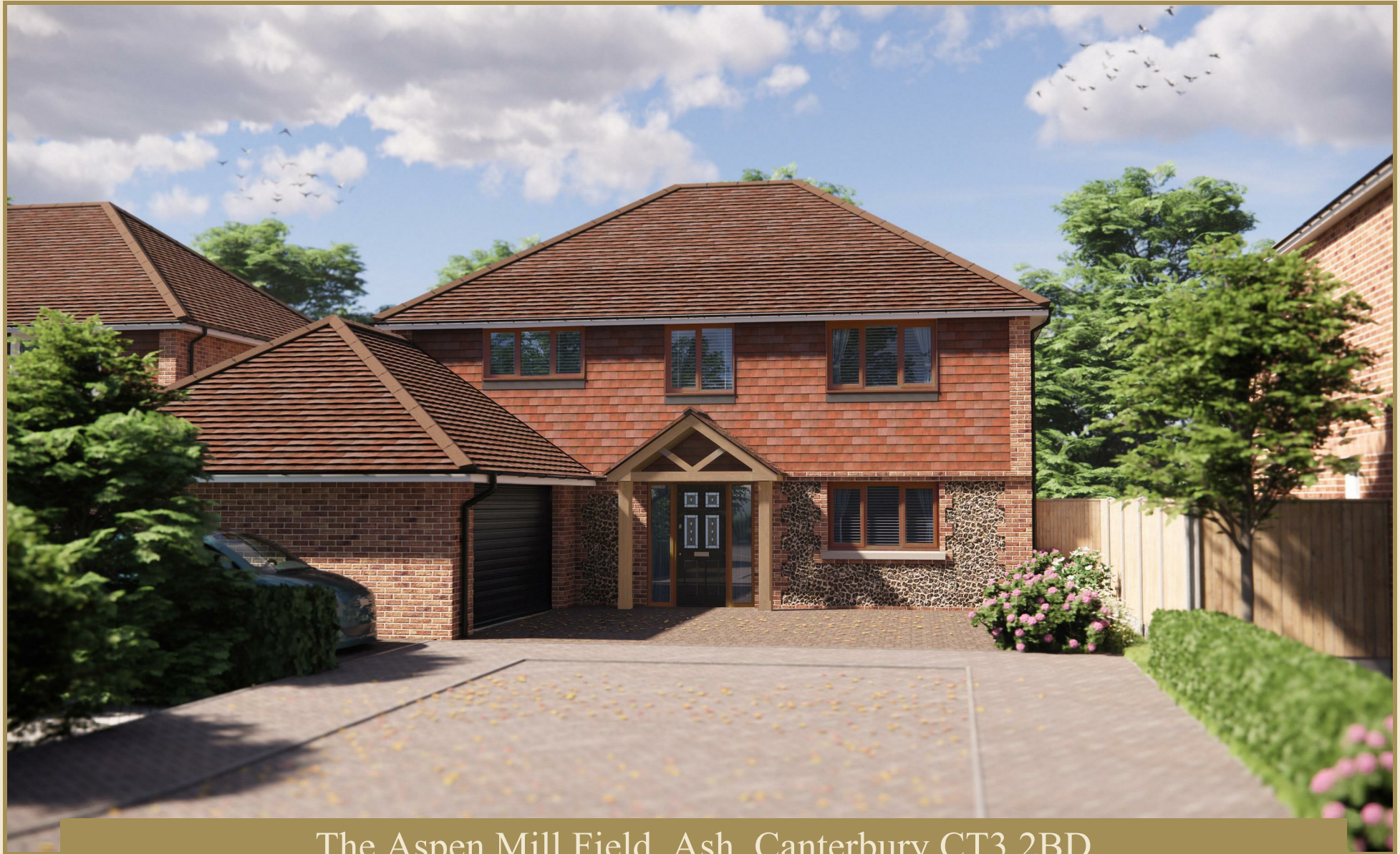
The Aspen Mill Field, Ash, Canterbury CT3 2BD